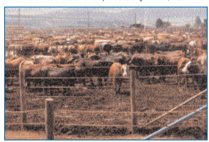
Pictures of Karan Beet's feed mill and feed lot holding 80,000 head of cattle. This feed facility is one of the largest in Africa.