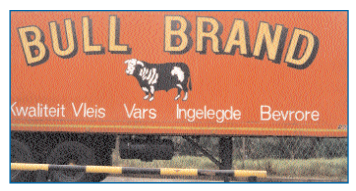
The Bull Brand sign and logo on one of its trucks.