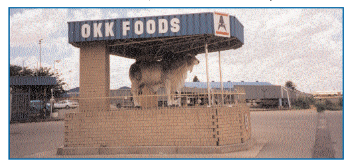
Company sign and cattle statue at OKK plant's main entrance.