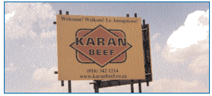
Sign welcoming visitors to the Karan Beef Company, located in Balfour, R.S.A. Issue No. 24, April 2002